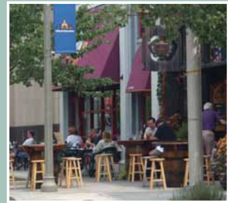
Atlanta residents enjoying the temperate weather by dining outside

For more on the city of Atlanta visit www.atlanta.net