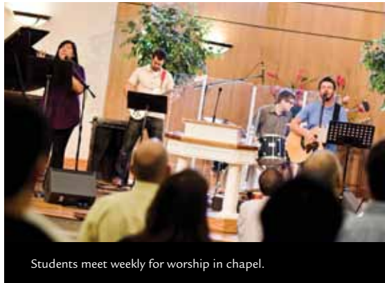
Students meet weekly for worship in chapel.